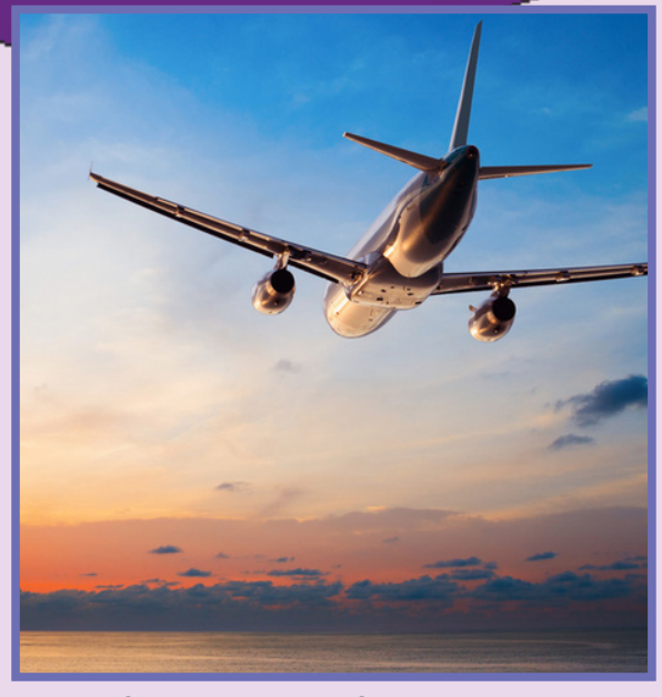
Useful links of airlines with service to Cluj Napoca:

Bus number # 8 runs from the airport to Mihai Viteazul square in the center of the city and bus number # 5 runs from the airport to the railway station.